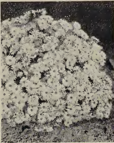
Dwarf Hybrid Border Asters